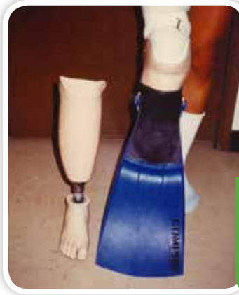
This amputee quickly removes a walking prosthesis, which has a special custom inner socket onto which a fin can then be slipped.